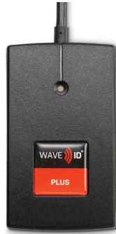
WAVE ID® Plus

END-TO-END SECURITY SOLUTIONS AND SERVICES COMBINED WITH CONTACTLESS AUTHENTICATION READERS.