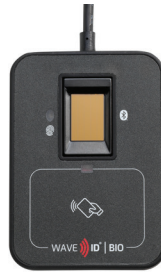
WAVE ID® Bio