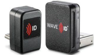
WAVE ID® Nano

The WAVE ID Plus reads most global proximity and contactless credentials including 125 kHz, 132 kHz or 13.56 MHz formats and is designed to fit seamlessly into your current system for time savings and workflow efficiency.