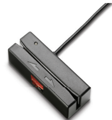
pcSwipe™ Magnetic Stripe

The WAVE ID Embedded OEM reader offers flexibility and modular design for seamless integration into an array of OEM products for off-the-shelf authentication technology.