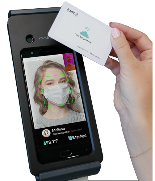
NFC Scan (Physical& Mobile)