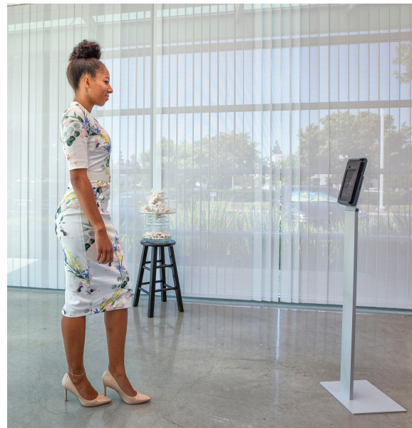
Contactless Temp Screener