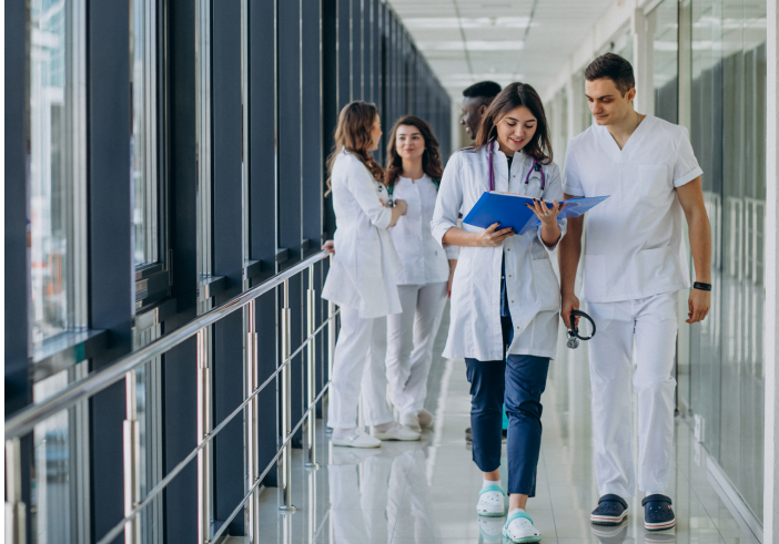
Hospitals and Clinics

Our advanced AI and robotics automation technology ensures temperature and health screening done quickly, contactless, and accurately, making it an ideal choice for high foot traffic locations