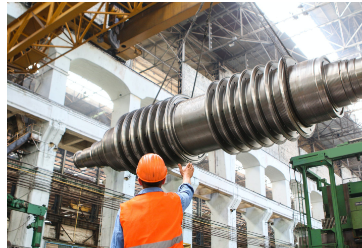
Manufacturing and Warehouse