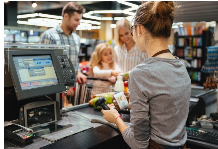
Retail Stores & Shopping Malls