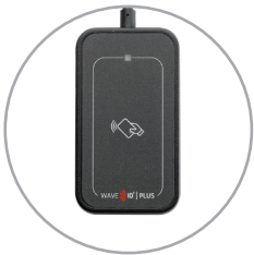
WAVE ID® Plus Mini dual-frequency card reader

Our new platform includes readers for wide-ranging authentication needs. WAVE ID® Bio for multi-factor authentication in a single reader. WAVE ID® Mobile for contactless mobile authentication. WAVE ID® Nano for dependable access on the go. With these readers and more, users can authenticate and get right to work, wherever they are, with nothing getting in the way.