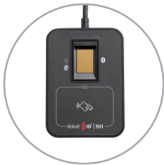
WAVE ID® Bio fingerprint, card and mobile credential reader