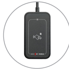
WAVE ID® Mobile Mini digital credential reader