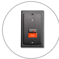
WAVE ID® Surface Mount dual-frequency card reader