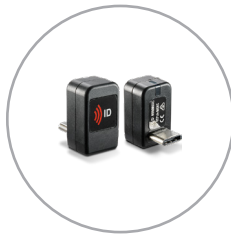
WAVE ID® Nano USB-C world's smallest, ultradurable card reader