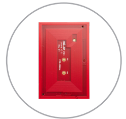
WAVE ID® Plus OEM embedded flexibility and modular design