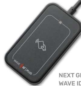
NEXT GEN WAVE ID® Plus Mini Same functionality – 35% smaller, 37% lighter