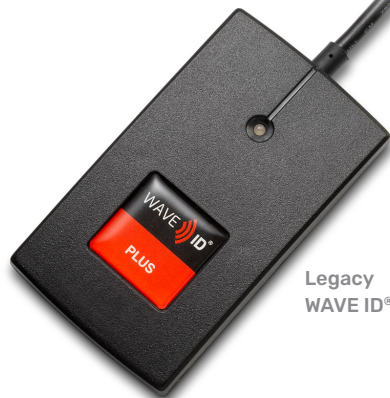
Legacy WAVE ID® Plus