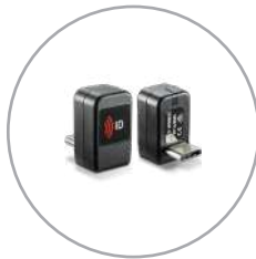
WAVE ID® Nano USB-C world's smallest, ultradurable card reader