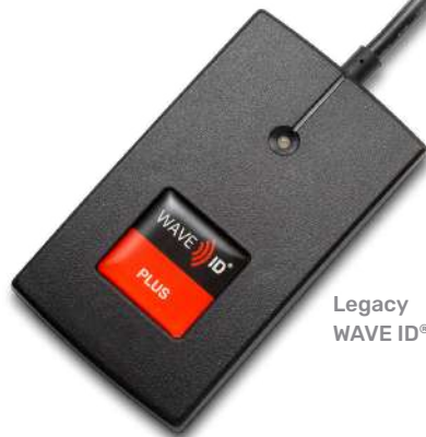
Legacy WAVE ID® Plus