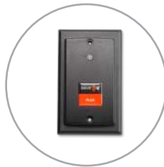
WAVE ID® Surface Mount dual-frequency card reader