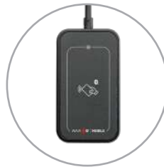
WAVE ID® Mobile Mini digital credential reader