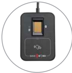
WAVE ID® Bio fingerprint, card and mobile credential reader