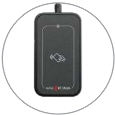
WAVE ID® Plus Mini dual-frequency card reader

Our new platform includes readers for wide-ranging authentication needs. WAVE ID® Bio for multi-factor authentication in a single reader. WAVE ID® Mobile for contactless mobile authentication. WAVE ID® Nano for dependable access on the go. With these readers and more, users can authenticate and get right to work, wherever they are, with nothing getting in the way.