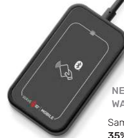
NEXT GEN WAVE ID® Plus Mini Same functionality – 35% smaller, 37% lighter