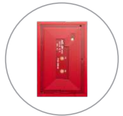
WAVE ID® Plus OEM embedded flexibility and modular design